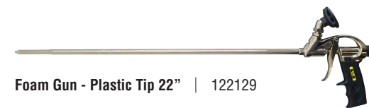
Foam Gun - Plastic Tip 22" | 122129