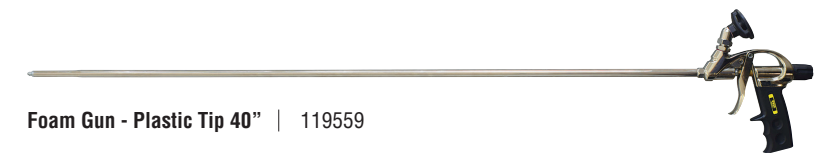
Foam Gun - Plastic Tip 40" | 119559