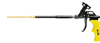
Foam Gun - Threaded Metal Tip | 144150