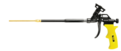
Foam Gun - Threaded Metal Tip | 144150