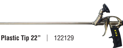
Foam Gun - Plastic Tip 22" | 122129